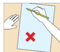
Paper position for right-handed children